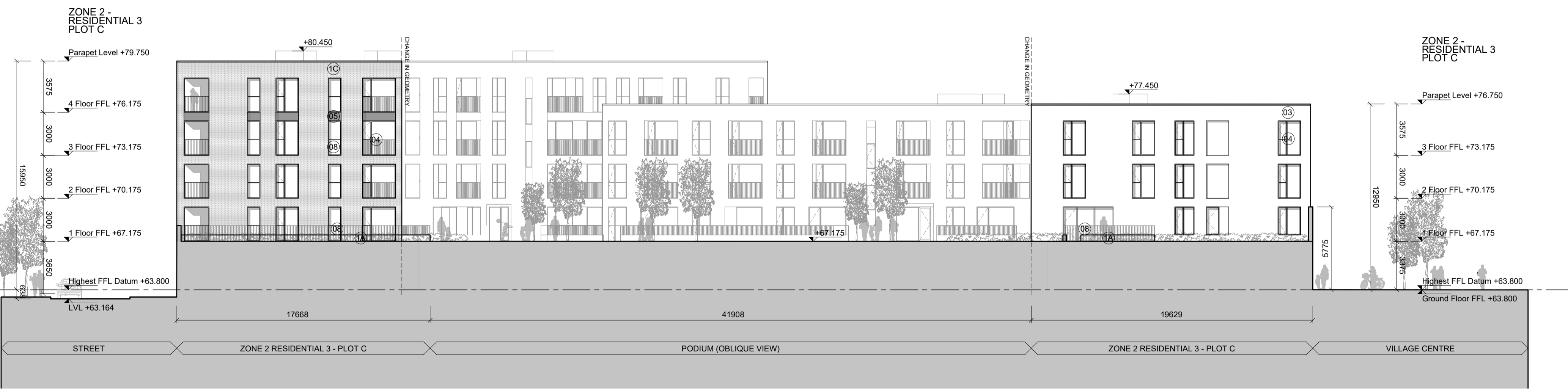
3 NORTH ELEVATION C401 SCALE: 1:200