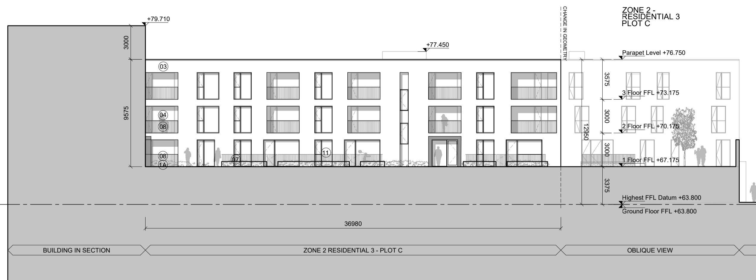
1 NORTH EAST INTERNAL ELEVATION C401 SCALE: 1:200