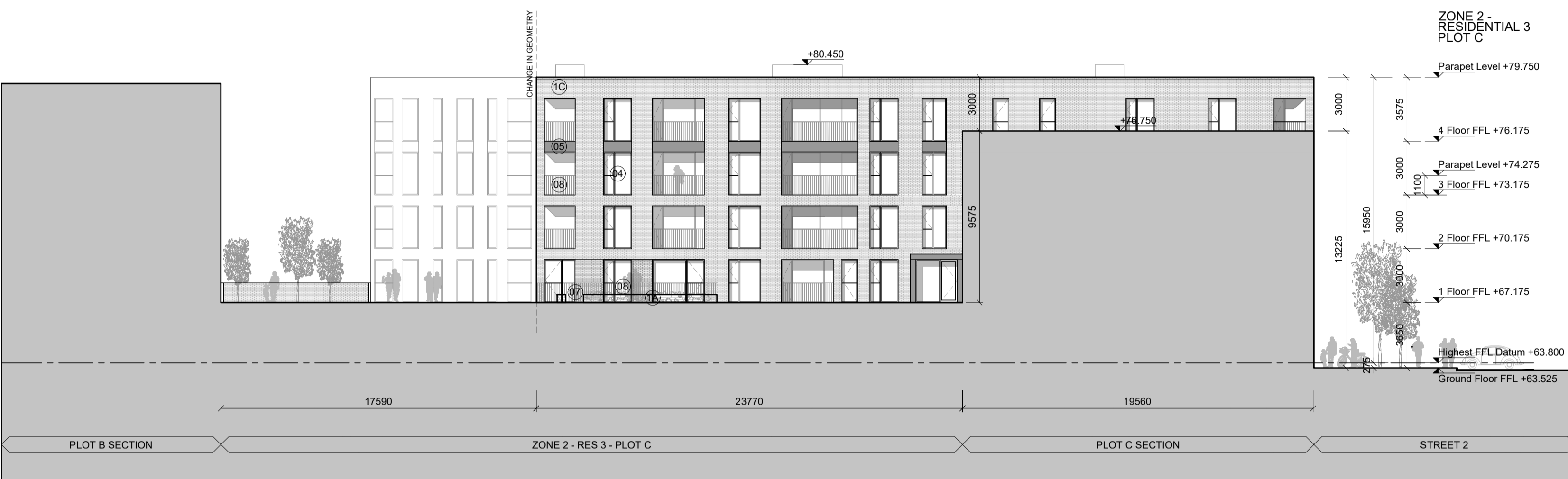
2 NORTH WEST ELEVATION C401 SCALE: 1:200